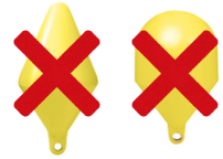
These buoys mark the swimming area